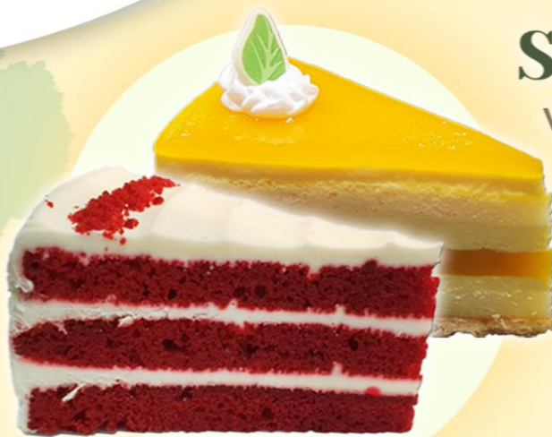
Sliced Cakes (SELECT AT COUNTER)