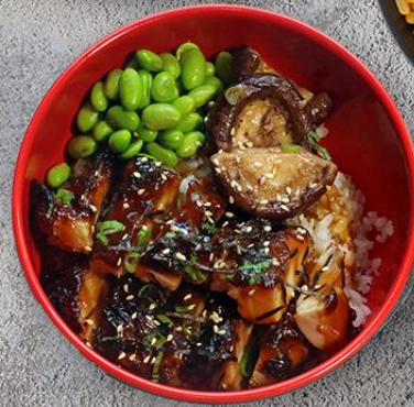
CHICKEN TERIYAKI DONBURI