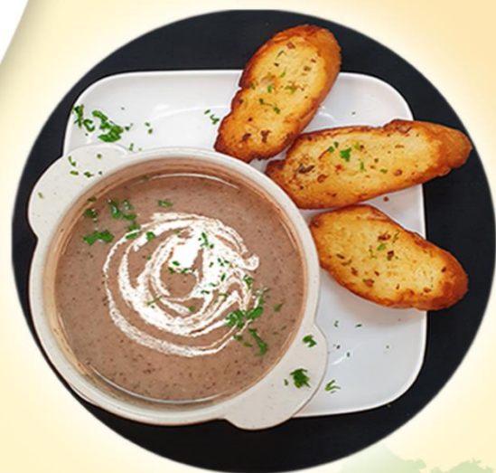
Soup of the Day WITH GARLIC BREAD (3PC)

WITH ANY PURCHASE OF SELECTED MAIN DISH ITEMS*