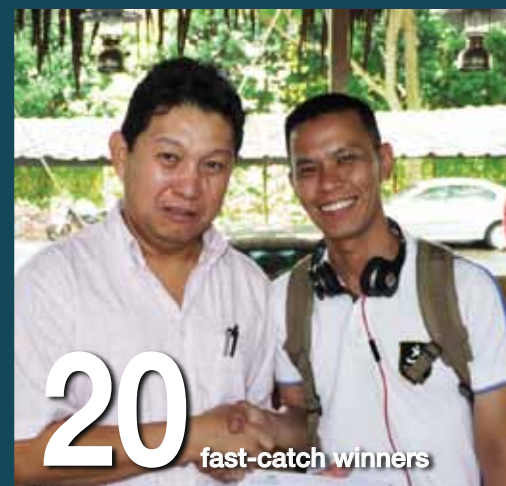
kg of prawns caught