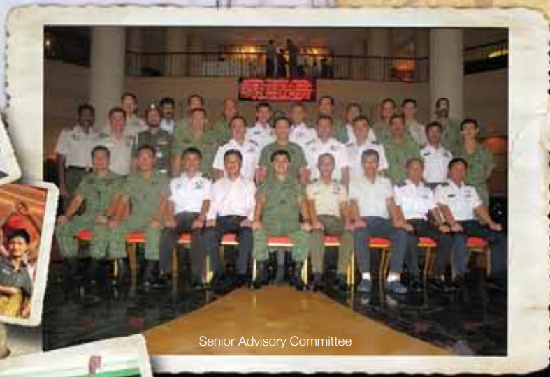
Senior Advisory Committee